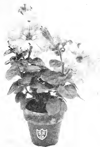
Well grown 3-inch pot Pride of Portland Petunia showing quality to perfection

A new selection, resembling a giant of California, large ruffled edges, soft heliotrope with network of darker veins radiating from dark colored throat. Vigorous thrifty grower, branching freely.